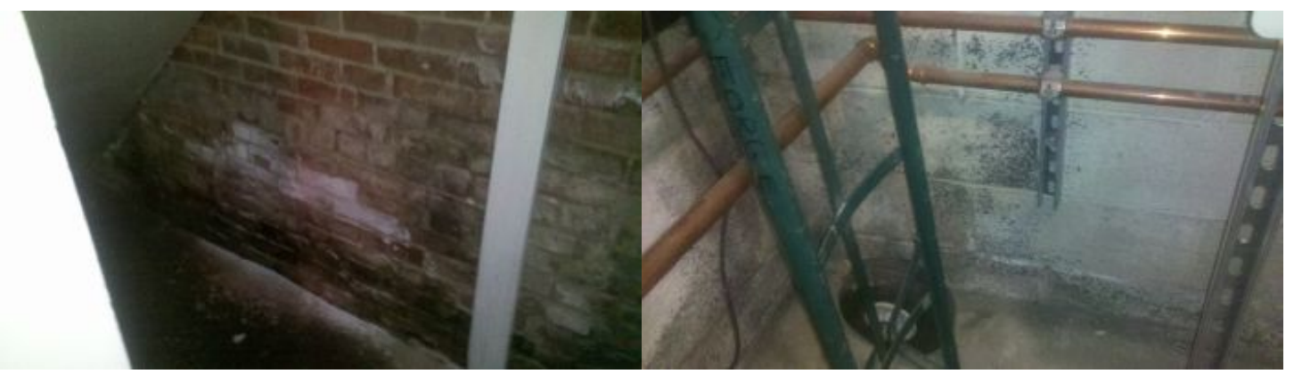
efflorescence and water staining on the foundation