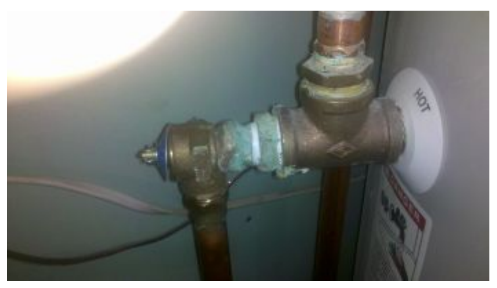
corrosion and short extension on water heater t/p relief valve