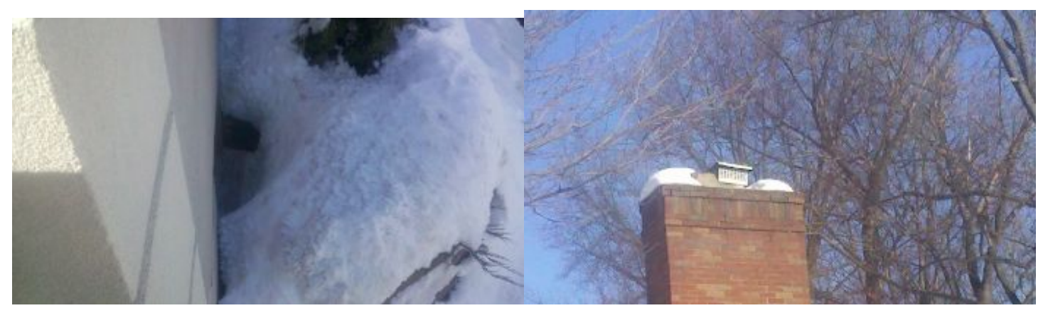
uncovered window wells