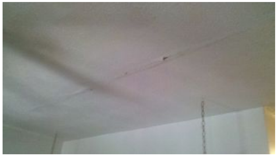
active ceiling stain in master bedroom