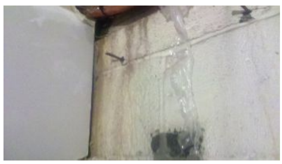
water stains on foundation walls