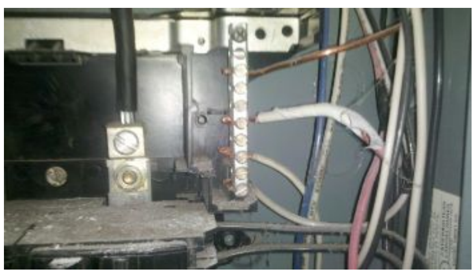
mixed grounds and neutrals in panel