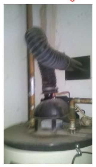
improper flue on water heater